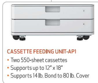
CASSETTE FEEDING UNIT-API