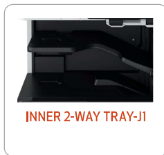
INNER 2-WAY TRAY-J1